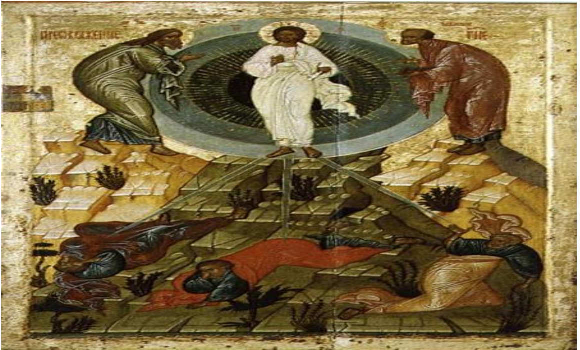
The Transfiguration of Christ